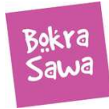
Bokra Sawa (France) http://www.bokrasawa.org/