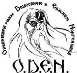
Asociata ODEN (Romania) https://www.facebook.com/Asociatia.ODEN/